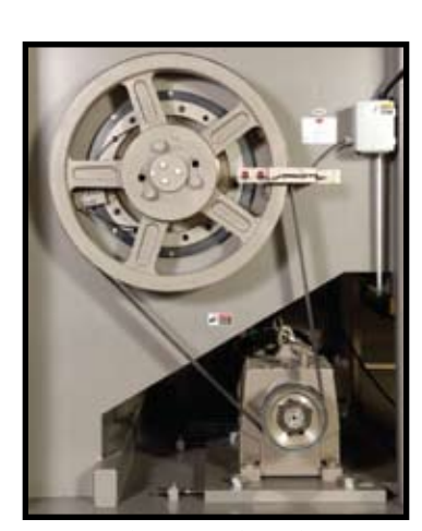
Agitator Drive Side